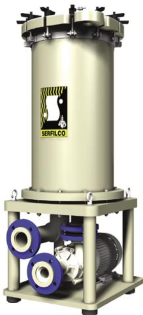
Model PL780(3) SH-3P-H4x3x9-L(M8xM1) H10-G3-SPB4-DWSF w/273 sq. ft. of equivalent solids holding capacity.

Filtration could prevent roughness, but to extend the life of the acid a product called 'PRO-pHX' was added to control the metal build-up and eliminate the oil film and organic build-up. The first plant to use this proven chemistry was in Hamilton, IN.